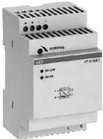
CP-D 12/2.1 CP-D 24/1.3