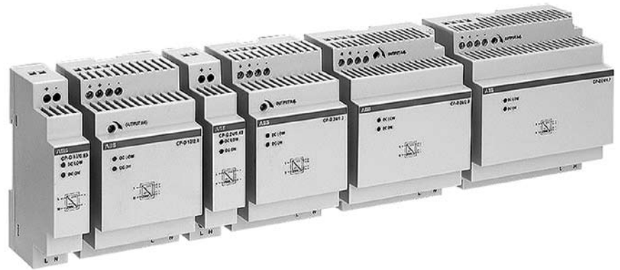
ABB Switched mode power supplies CP Range